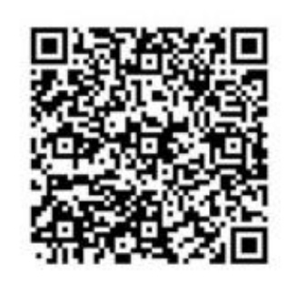
Utah Area Temporal Preparedness Guide

Tune in to the National Oceanic and Atmospheric Administration Weather Radio (NOAA), the National Weather Service, or local radio and television stations for updates.